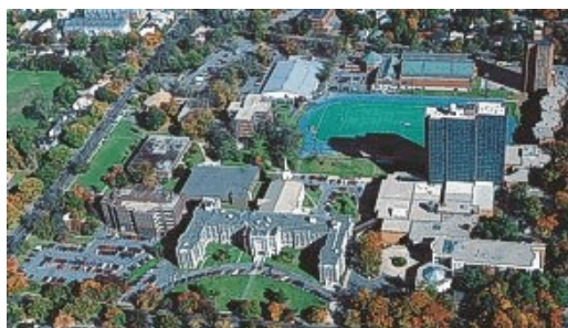
Saint Mary's University