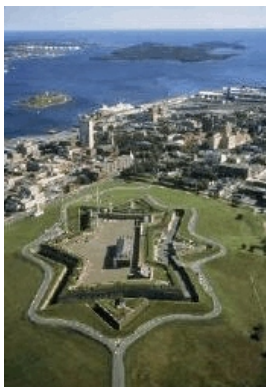
The Halifax Citadel